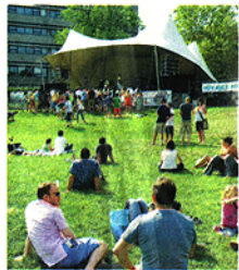
BY ROYAL NOYRIZ

mixed-up histories and even gags of timing. Among them: a video that captures an out-of-context reenactment of a speech from the 1963 March on Washington; an installation that mimics the artist's home, but with a few off-the-wall additions; and tweaked photos of violent events. The show opens tonight with a reception and continues through Aug. 22. Free. The reception is from 6 to 9 p.m. 3550 Wilson Blvd., Arlington. 703-248-6800 or www.arlingtonartscenter.org .